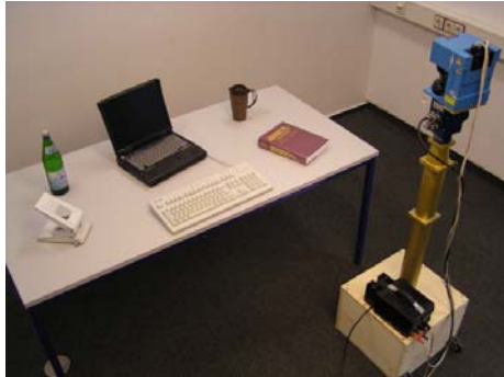
Figure 1: Table scene with scanning equipment